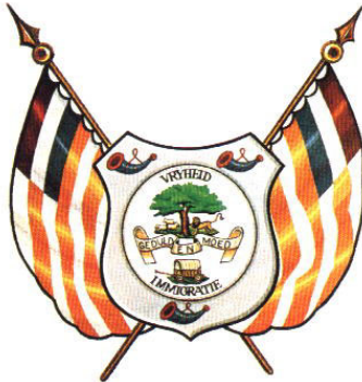
Oranje Vrijstaat Republiek