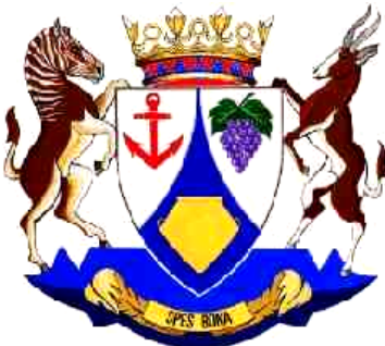
Western Cape Province