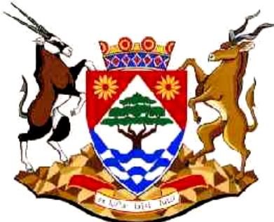
Northern Cape Province