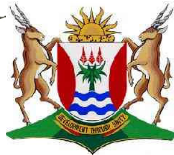
Eastern Cape Province